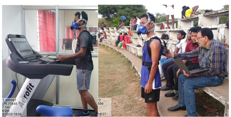
Strength & Conditioning Lab