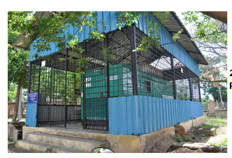
24 x 7 Uninterrupted Power Supply