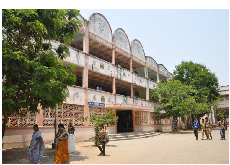
Class Rooms Platinum Jubilee Block