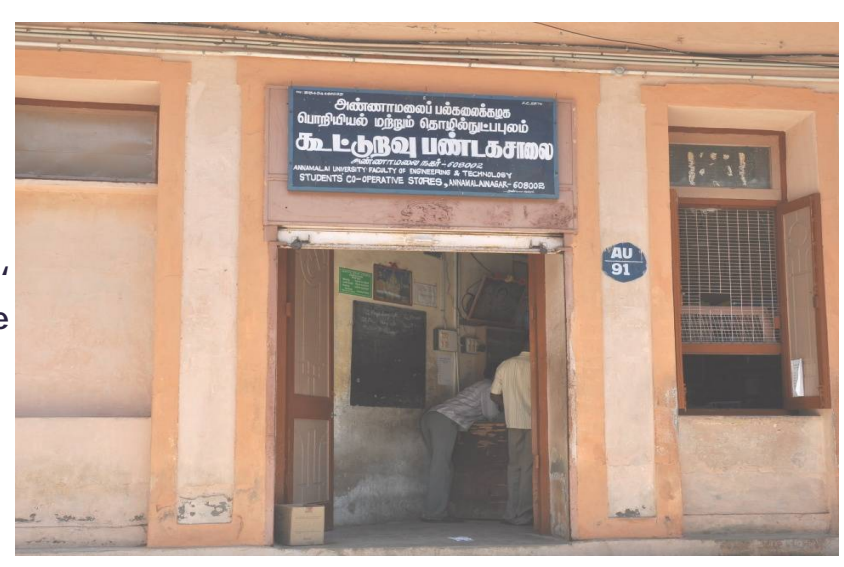
Students' Co-op Store