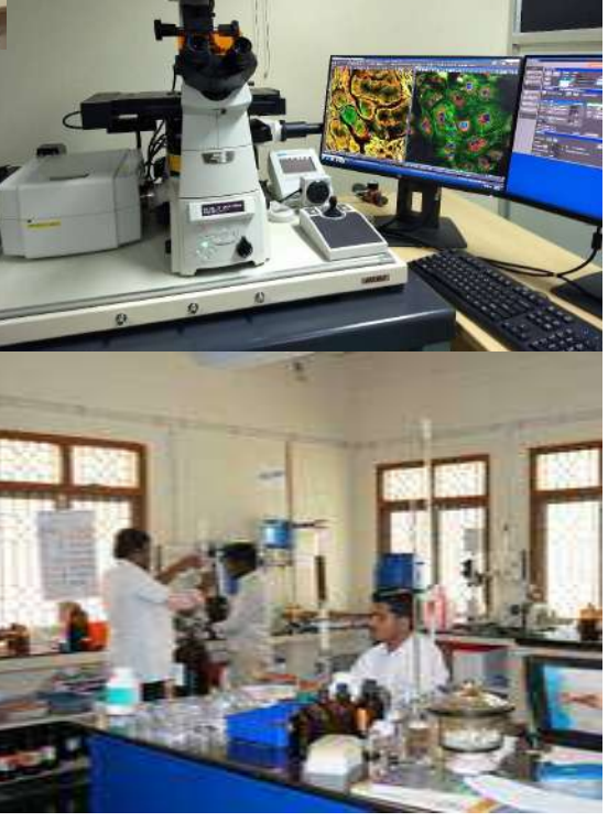
Instruments Lab - Marine Sciences