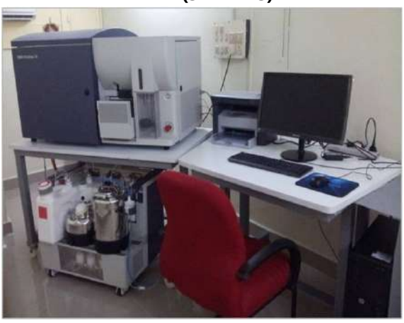
Flow Cytometer Cell Sorter (FACS)