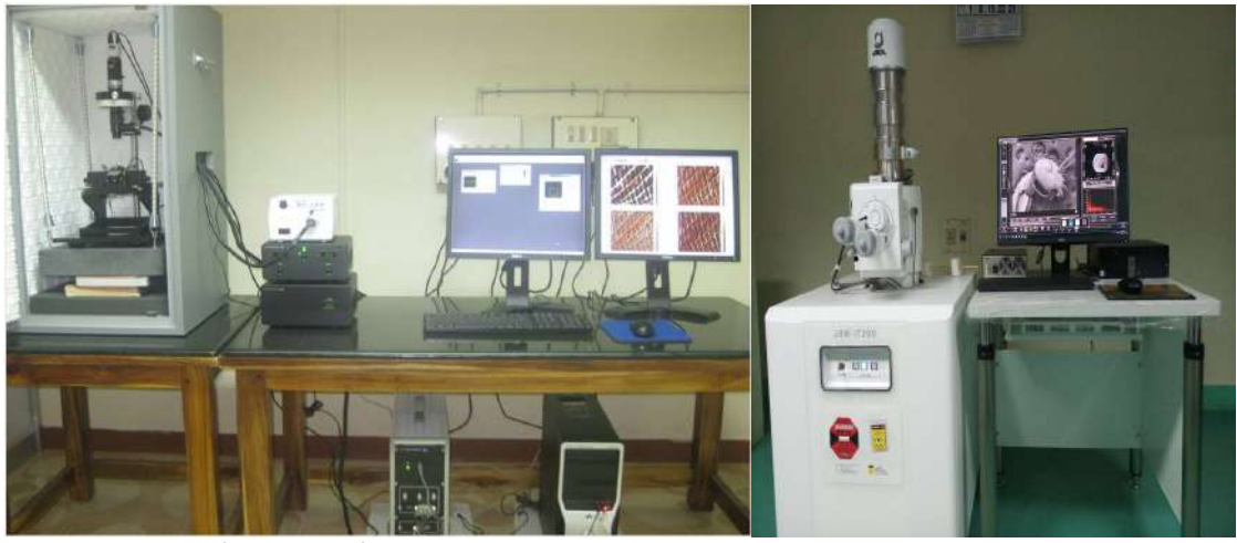
Atomic Force Microscope (AFM)