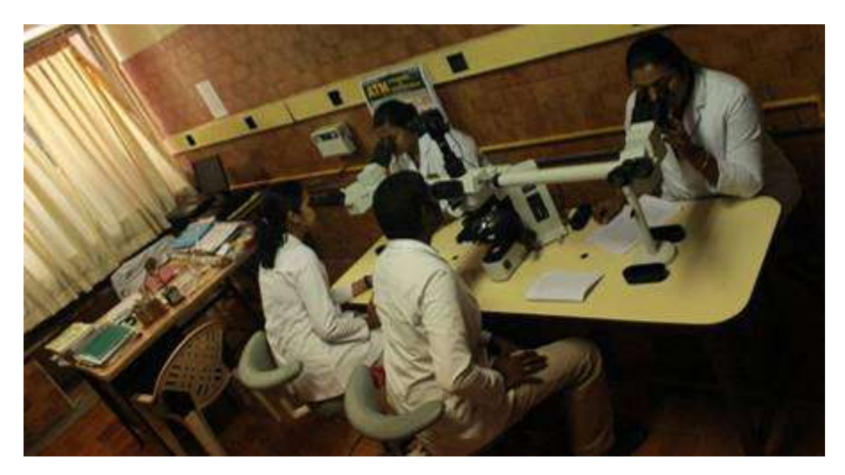
Oral Pathology P.G. Lab