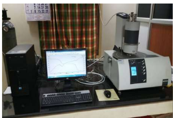
Simultaneous Thermal Analyser (STA)