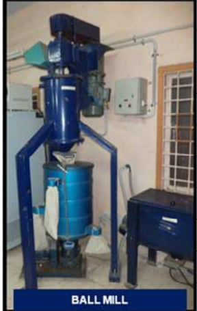
Instruments at Faculty of Agriculture