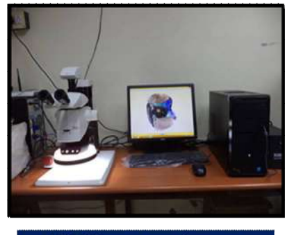
LEICA Stereo zoom microscope