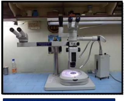
TRINOCULAR STEREOSCOPIC ZOOM MICROSCOPE