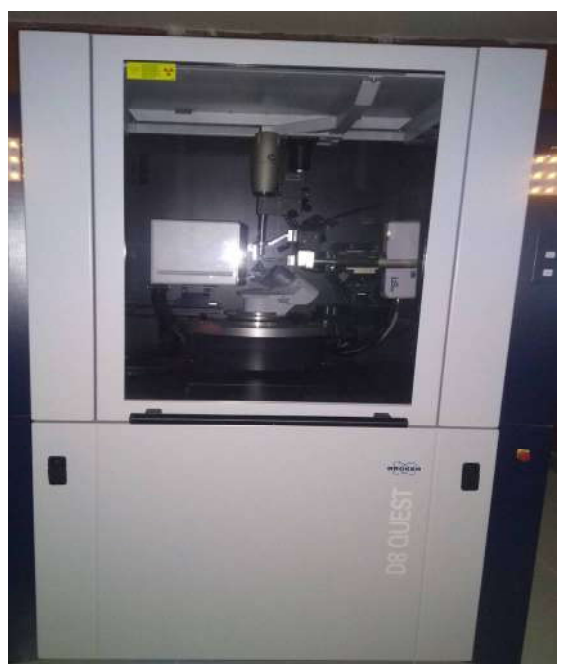
Single Crystal XRD (Brucker)