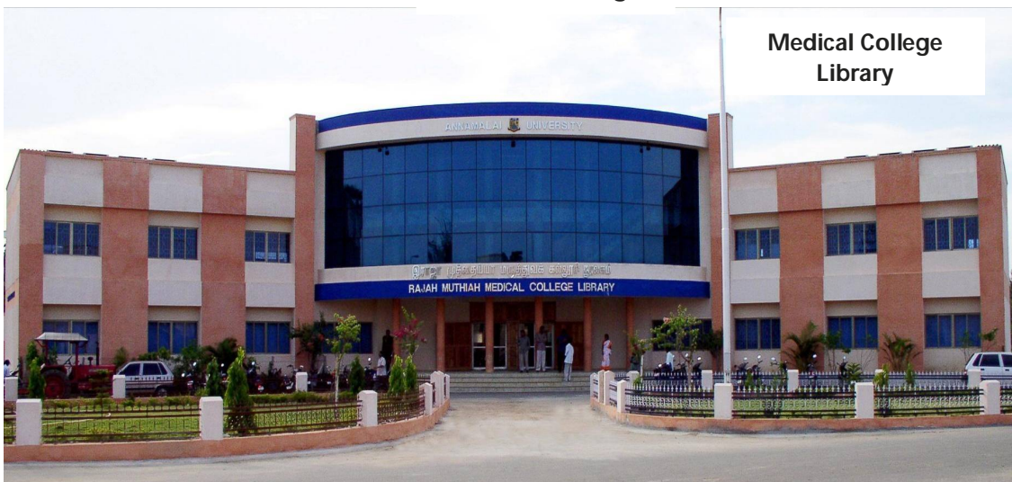
Medical College Library