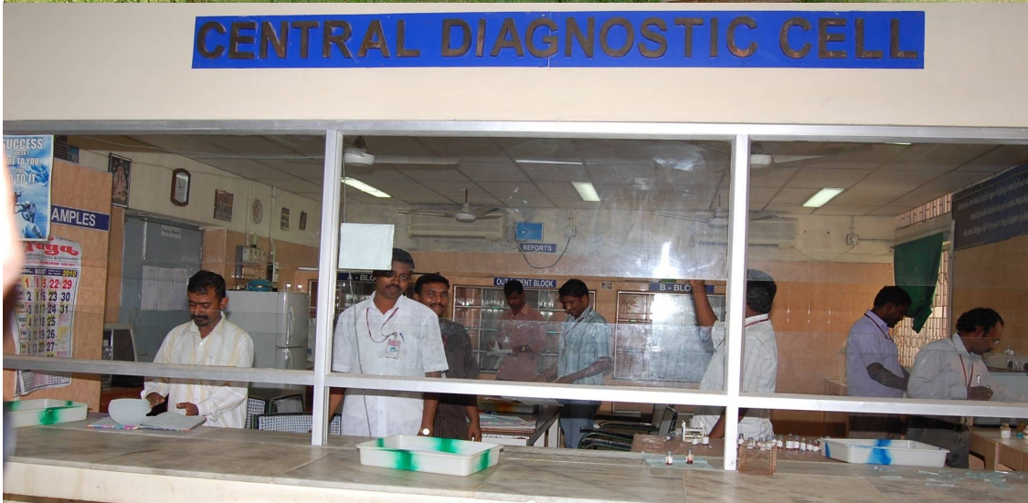
CENTRAL DIAGNOSTIC CELL