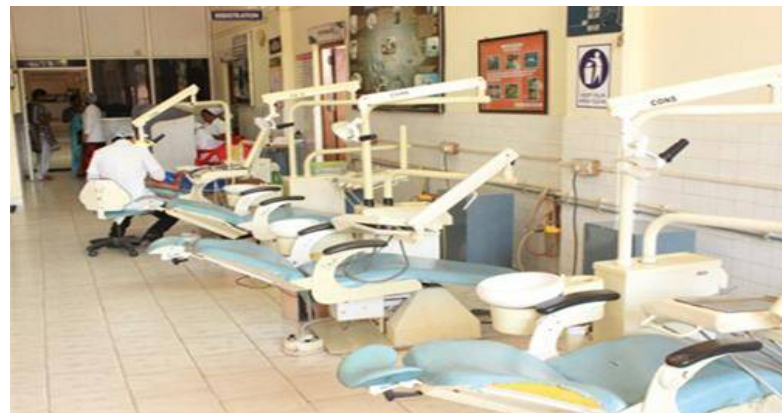
Endodontics U.G. Clinic