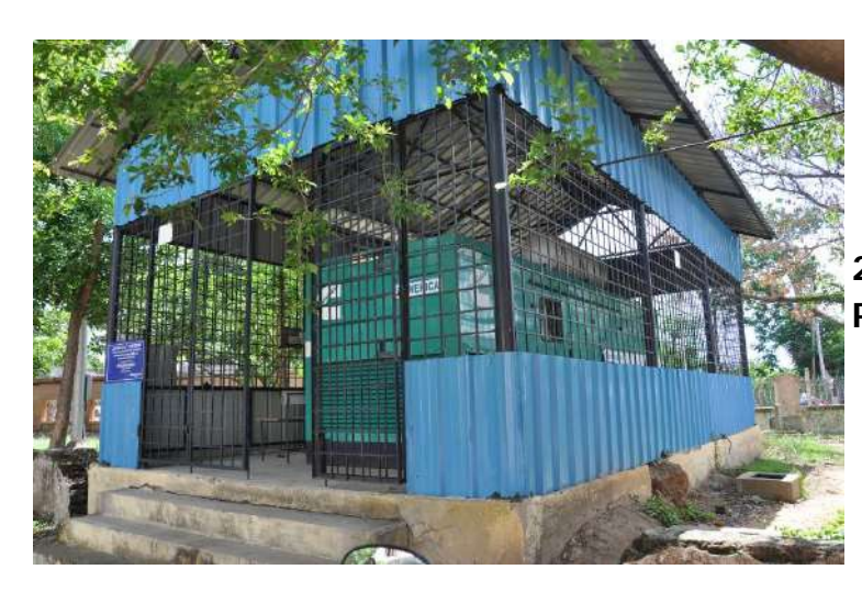
24 x 7 Uninterrupted Power Supply