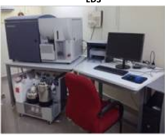
Flow Cytometer Cell Sorter (FACS)