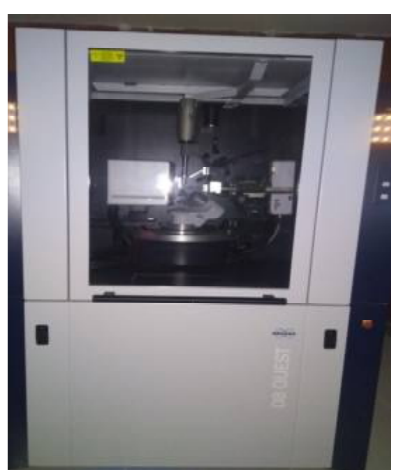
Single Crystal XRD (Brucker)