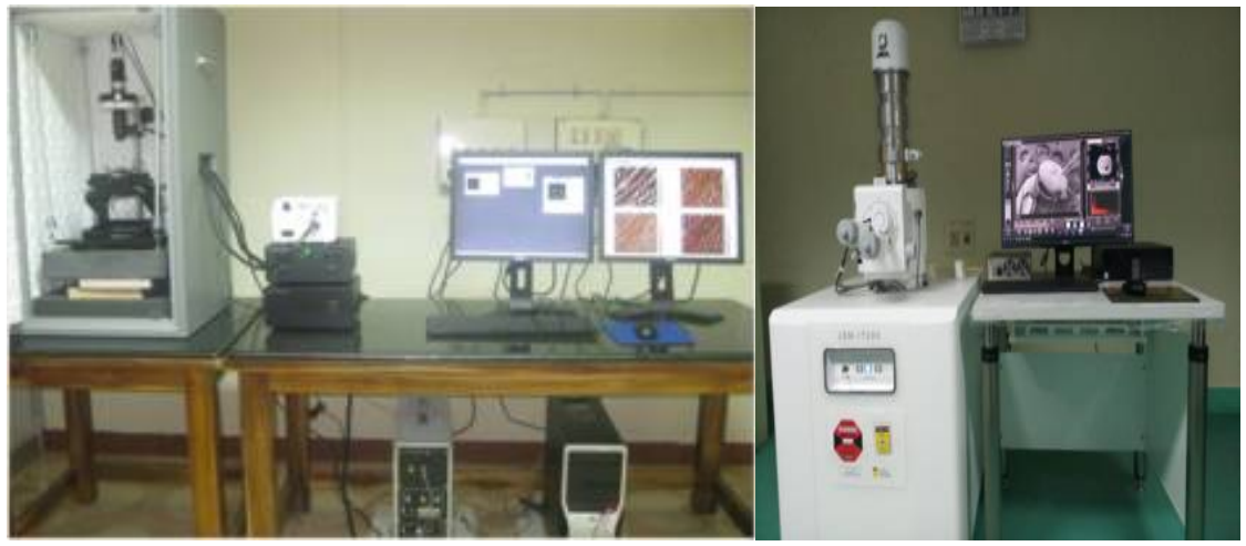
Atomic Force Microscope (AFM)