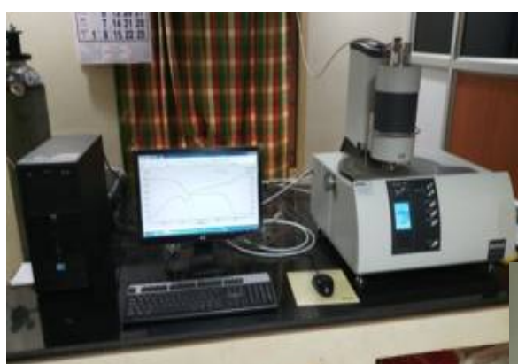
Simultaneous Thermal Analyser (STA)