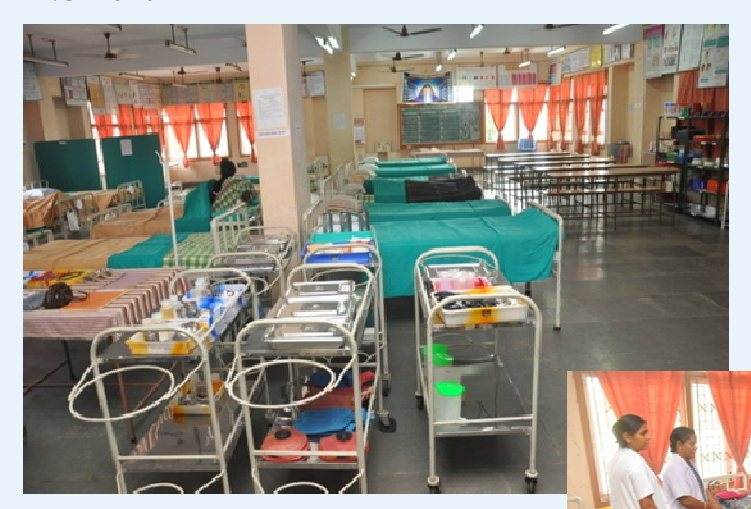
Nursing foundations lab