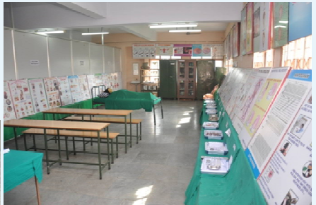
OGB Nursing lab