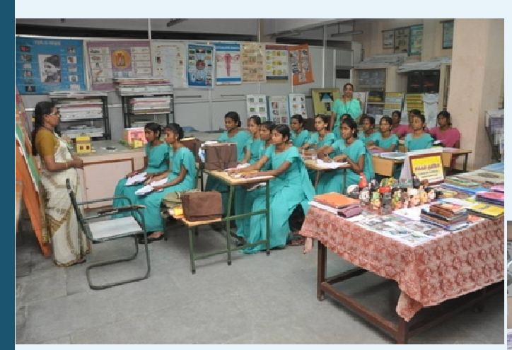
Community Health Nursing lab