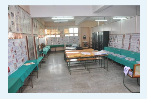
Paediatric Nursing lab