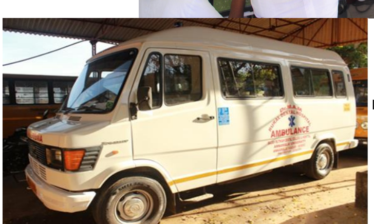
Mobile Dental Unit