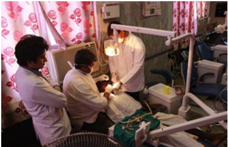
Minor Operation Theatre