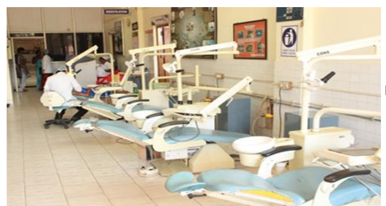
Endodontics U.G. Clinic