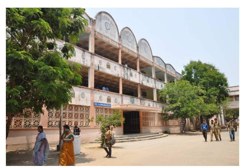
Class Rooms Platinum Jubilee Block