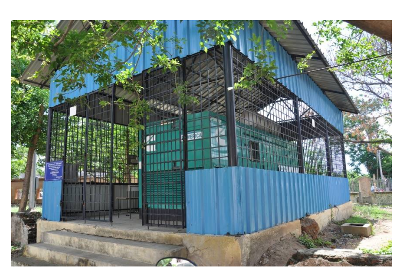
24 x 7 Uninterrupted Power Supply