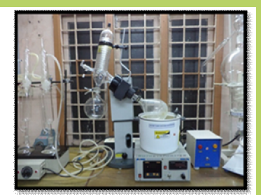
ROTARAY VACUUMFLASH EVAPORATOR