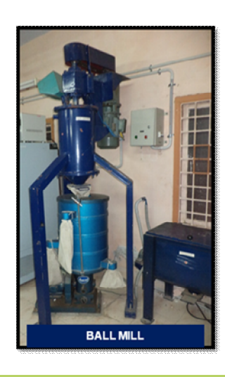
Instruments at Faculty of Agriculture