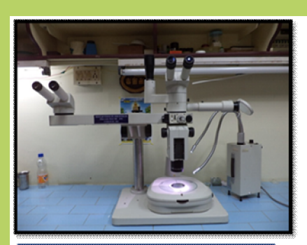
TRINOCULAR STEREOSCOPIC ZOOM MICROSCOPE