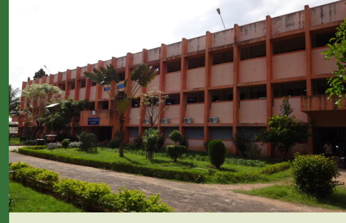
Class Rooms - New Block