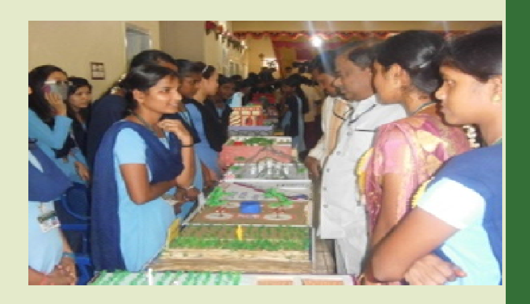
Visitors service is being offered to the farmers and school children on their request at free of cost.