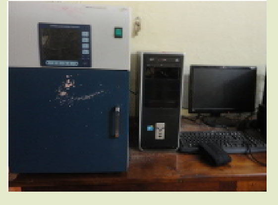
Gel Documentation System