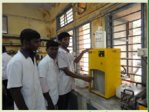
N Digester (FIST)