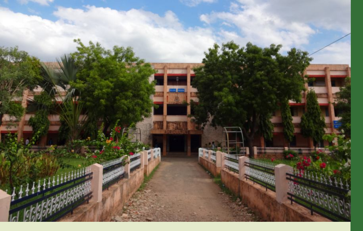
Class Rooms - Old Block