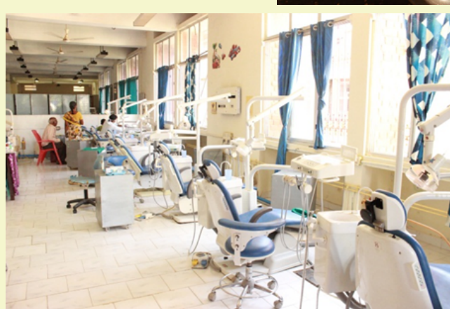
Pedodontics P.G. Clinic