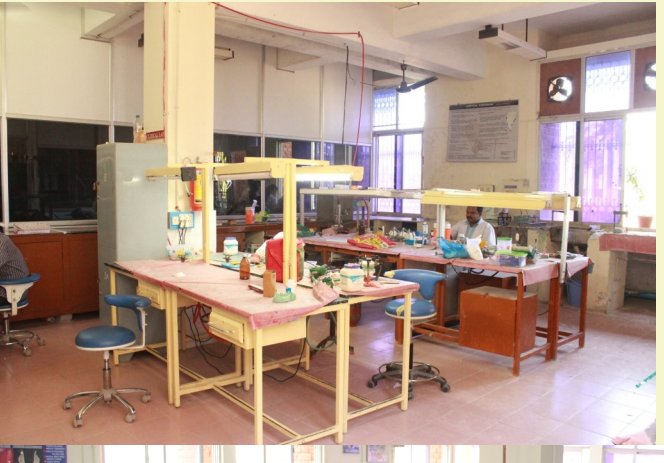
Prosthodontics P.G. Lab