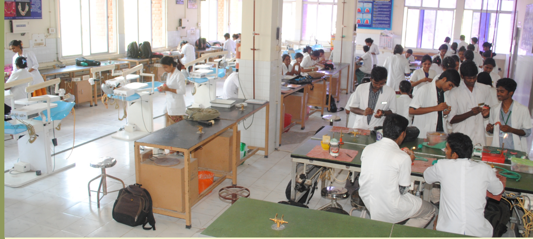
Prostho Preclinical & Clinical Lab1