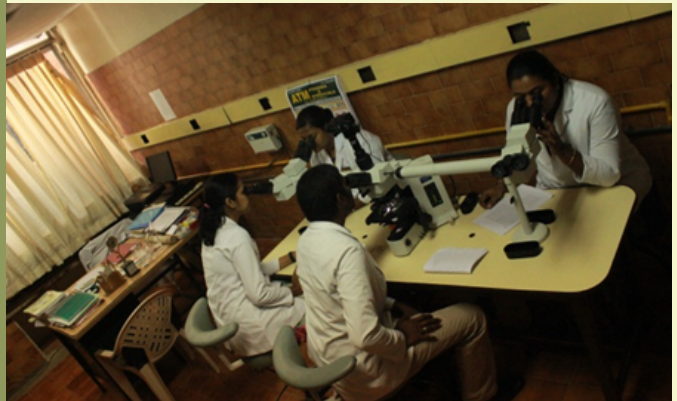
Oral Pathology P.G. CLINIC